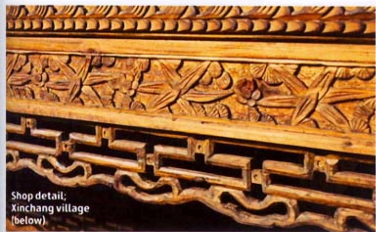
Shop detail: Xinchang village (below)