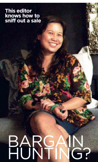
This editor knows how to sniff out a sale

Voyage de la Vie (Journey of Life) is filled with circus acts, fantastic stunts and costumes that are the brainchild of Mark Fisher, who is known for the world tour sets of The Rolling Stones and U2, and the ceremonies of the Torino 2006 and Beijing 2008 Olympics. At Festive Grand, Resorts World Sentosa from June 17, 2010. www.sistic.com.sg and www.rwsentosa.com