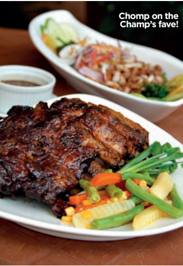
Chomp on the Champ's fave!