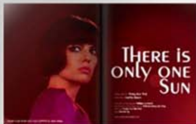
There is only one Sun/ Wong Kar Wai